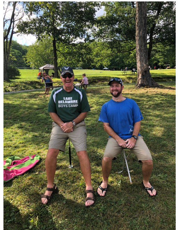
Carrying on the GOAS family tradition