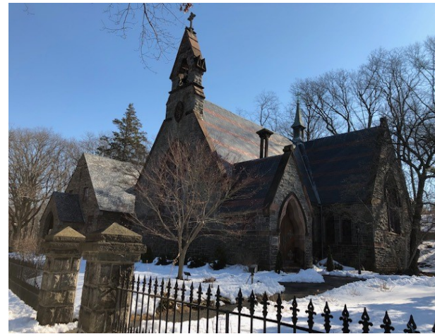
Christ Church Riverdale