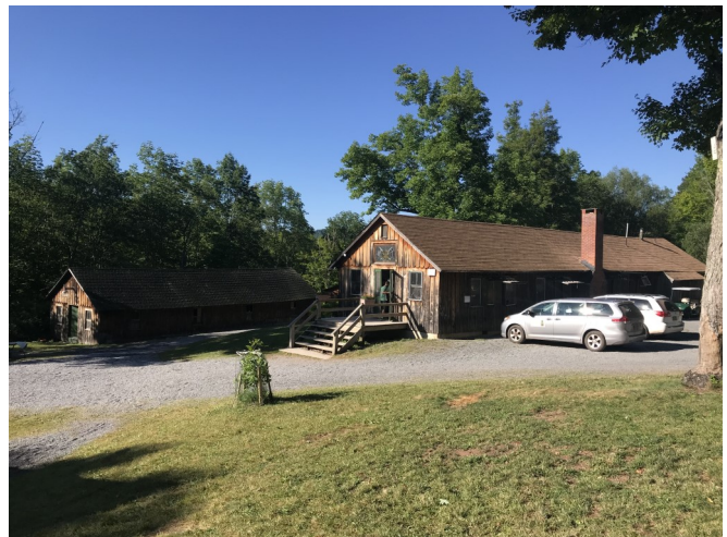
Summer 2019 was the last summer with the Armory and Original Mess Hall.