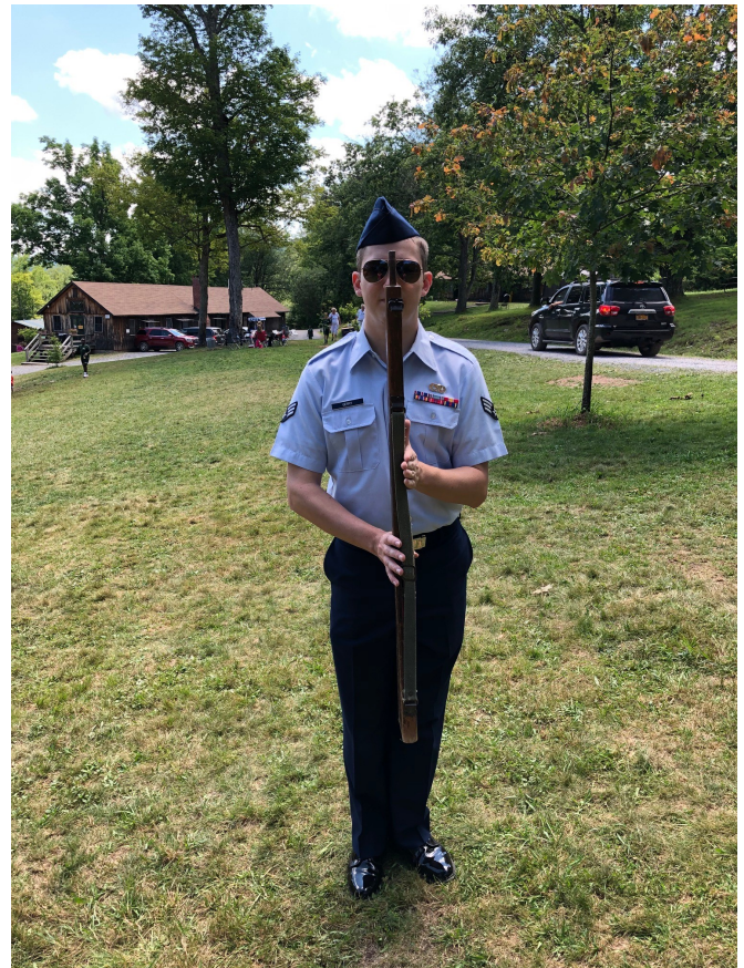
Alumni Drill down winner