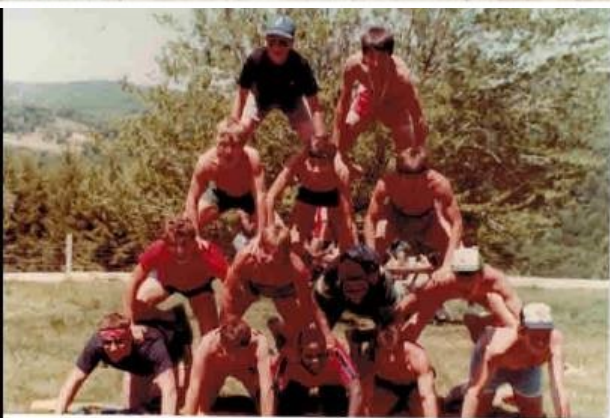
Grads of 1983