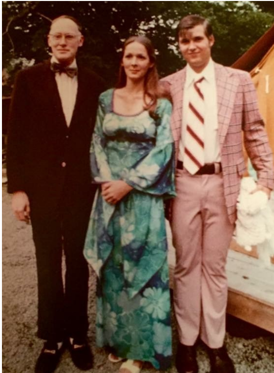
Team LDBC '06 - ten(!) years on!